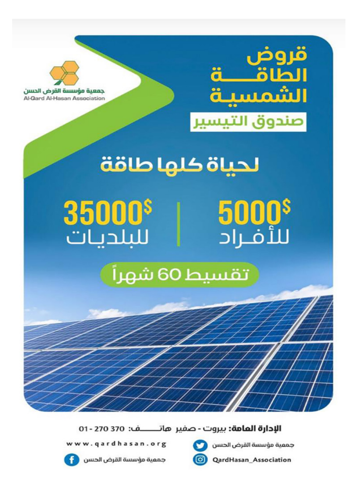
Figure 1. AQAH Solar Power Advertisement

Hezbollah's al-Qard al-Hassan financial arm offers loans for solar power: US$35,000 for municipalities and US$5,000 for individuals, to be paid over sixty months. An analysis shows this option to be cheaper than generator power, but the Chinese-made solar panels are not well made.